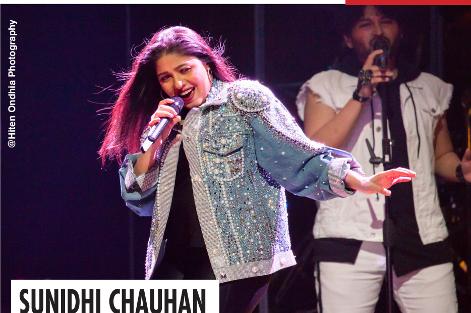
@Hiten Ondhia Photography